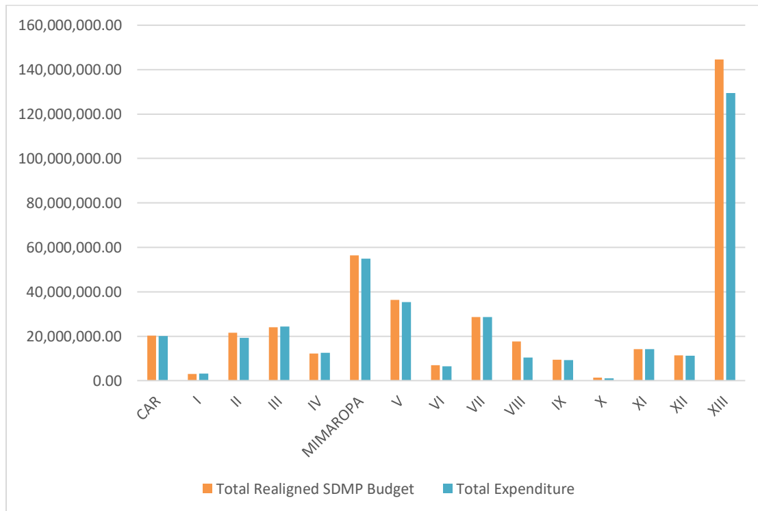
Table No. 4 shows the summary of the realigned unutilized SDMP budget and total actual expenditure of the companies per region. Some companies spent over their targeted budget through their Corporate Social Responsibility (CSR) funds in the amount of Php26,210,102.04 to support affected communities due to COVID-19.